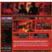
Below: Fallen Industries Website