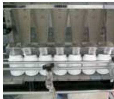
Left: The Pharmapac UK production line.

"...I THINK IT'S IMPORTANT THAT THE COUNCIL MAKES A POSITIVE DIFFERENCE..."